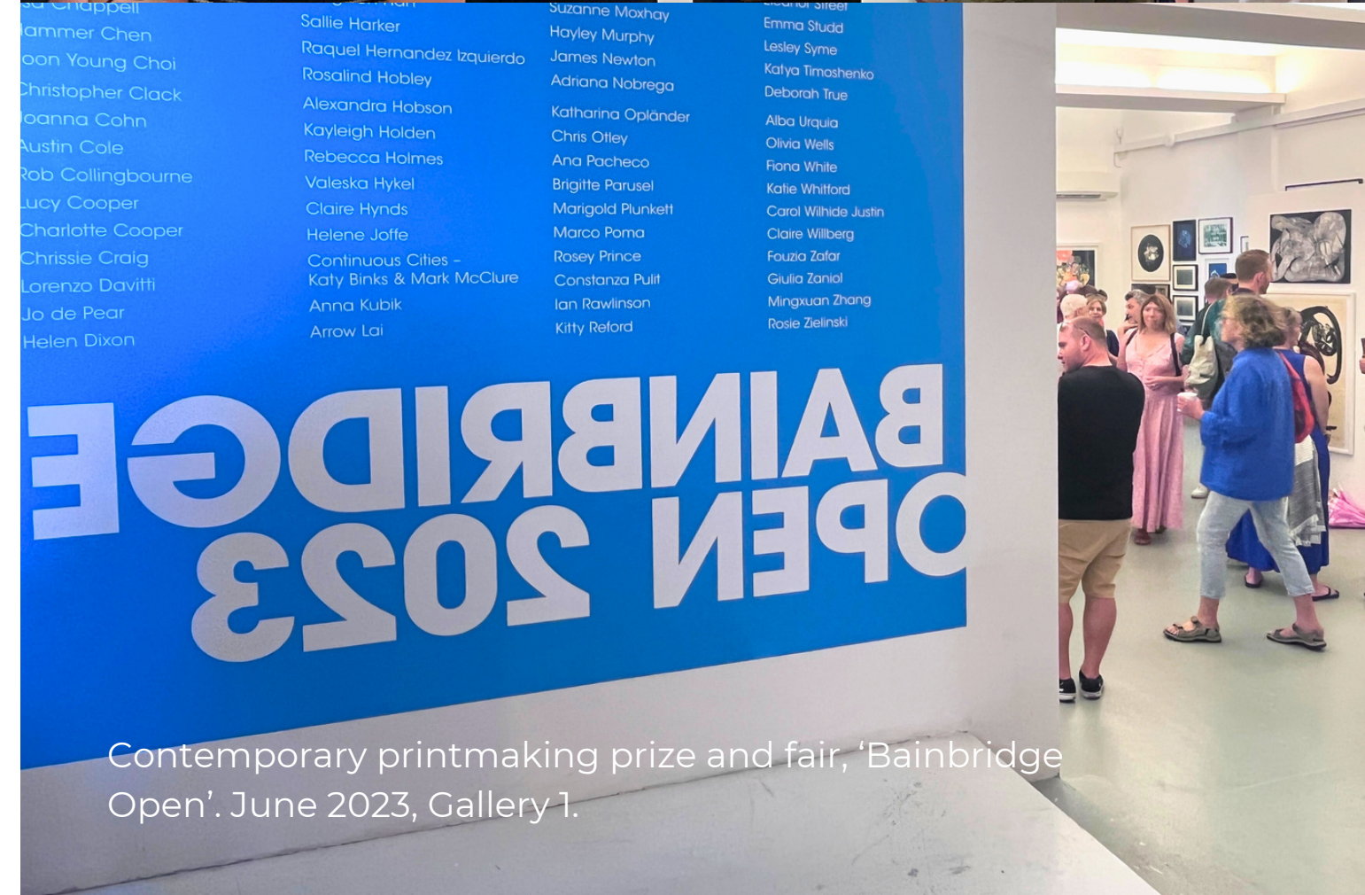
Contemporary printmaking prize and fair, 'Bainbridge Open'. June 2023, Gallery 1.