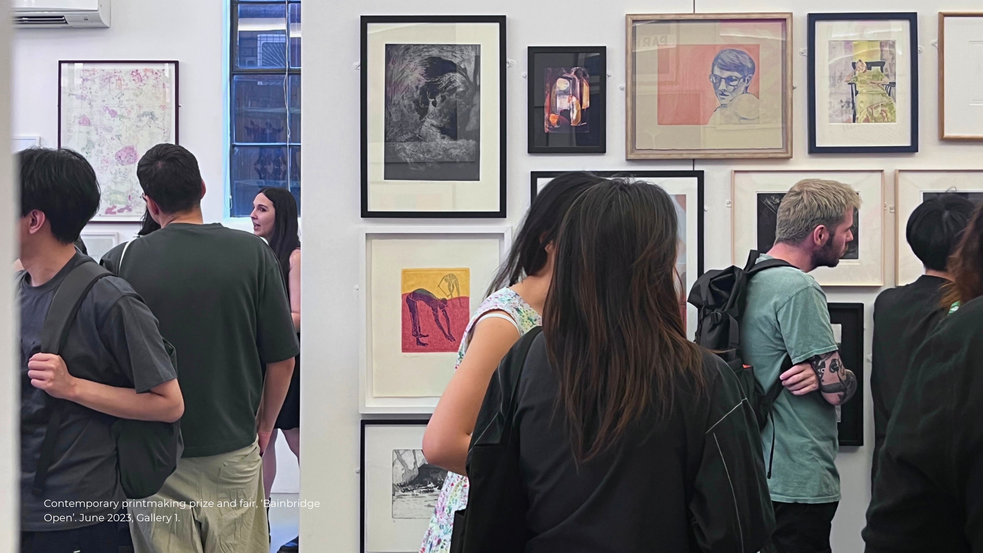
Contemporary printmaking prize and fair, 'Bainbridge Open'. June 2023, Gallery 1.