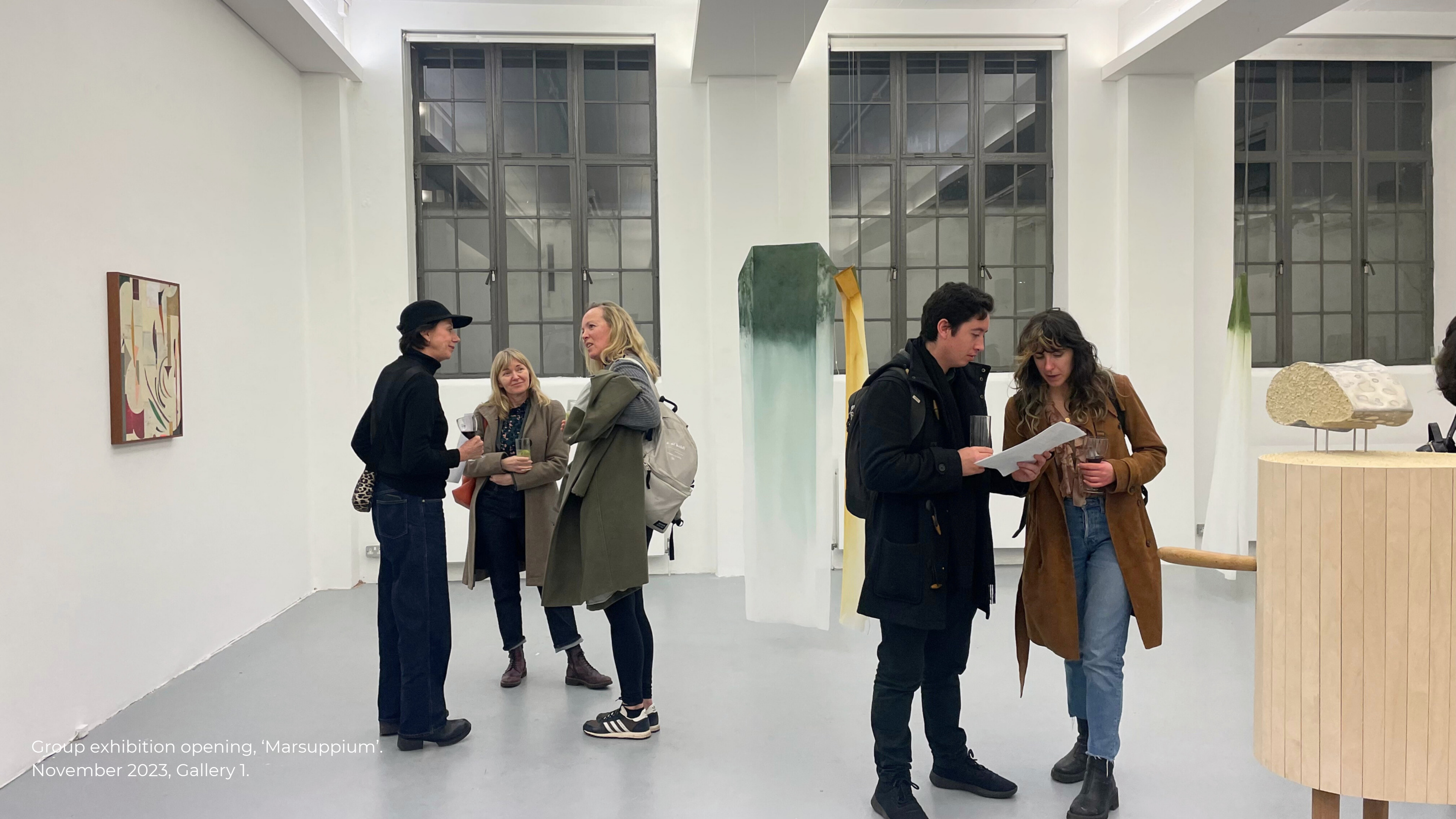
Group exhibition opening, 'Marsuppium'. November 2023, Gallery 1.